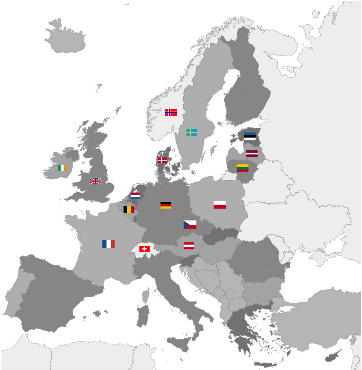
Participating countries in this study are marked with a flag.

In the following chapters information from 16 European countries are listed (countries are listed alphabetically). Representatives from each country have answered a questionnaire concerning the status of organic VCU testing in their country. Practical information on the VCU testing is listed in tables and some countries have provided information on the testing parameters used and the varieties that have been listed based on organic testing results, this information is also listed in tables. At the end of each chapter some information about organic variety trials not intended for national listing is provided.